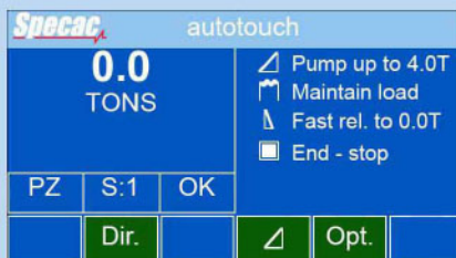
Main Operating Screen