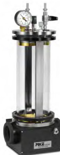
Variable-Path Gas Cell

For optimal performance the mirrors have been diamond turned and coated with the highest quality gold for maximum reflectivity and inertness. The accessory mirrors are mounted permanently with mechanical mirror mounts to eliminate out-gassing chemicals that may occur when using epoxies to secure the mirrors. Windows are easily replaceable and a variety of window materials are available.