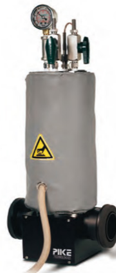
5-m Heated Gas Cell